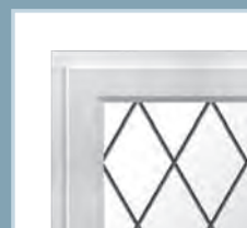
DIAMOND LEADED OPTION