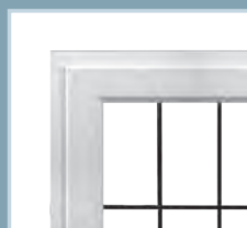
SQUARE LEADED OPTION